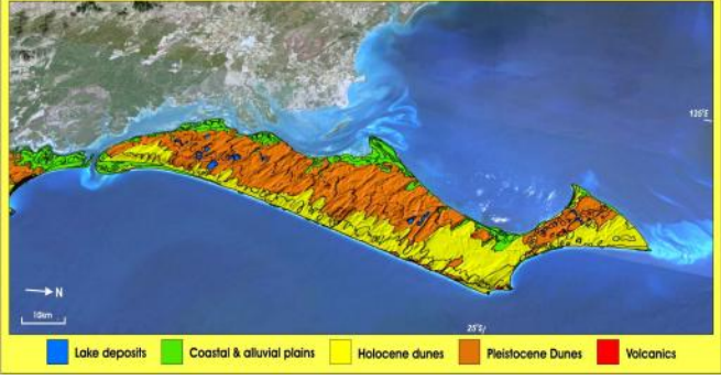
This illustrates the accumulation of sand moved down the western Zeta Curve and deposited near Moon Point.

FIDO also proposes that the boundaries on the western side of Fraser Island near Moon Point should also be extended into Hervey Bay to include the huge movements and relocation of sand around the end of the Zeta Curve. This is the most dynamic area of coastal sand movement along the western side of the island. A decade ago the Pelican Banks were small and submerged by almost every high tide. Now they are significantly larger and represent a sand island and growing larger and higher. It now sits higher than all tides and vegetation is beginning to take hold. The source of the sand is the erosion occurring along the area from Rooneys Point to Moon Point.